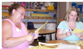
These two mom's made the cut!

Special thanks to Lincoln Elementary School for hosting the event.